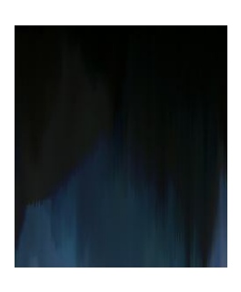
b) encrypted image