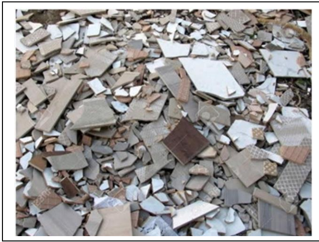
Figure 5: Ceramic waste in a construction site

on site while fixing. In developed nations, the recycling of ceramic wastes is being practiced and this is done by mixing the ceramic wastes with concrete while building, which is rarely the case in developing countries like Nigeria [32]. From figure 5 below, the outcome is a material with increased compressive strength.