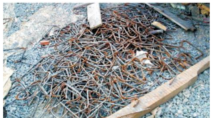
Figure 4: Metal waste in a construction site

The increasing use of metals in construction indicates a corresponding rise in the generation of metal waste. Metals are among the most preferred building materials due to their availability in various forms and shapes. In Nigeria, the management of metal waste has been poorly managed, which has led to environmental hazards because a large percentage of the metals thrown as wastes are not recycled and reused to manufacture other materials [29] (see figure 4)