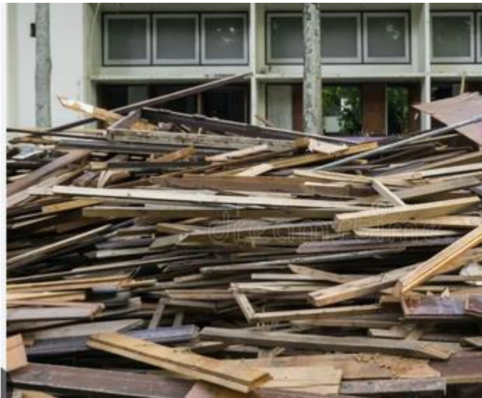
Figure 2: Wood waste in a building site

This material is used in different forms in a construction site. It may be chip wood, plywood, shavings, sawdust and may be used as elements such as doors. Wood becomes a construction waste if it is rendered useless and thrown into the garbage [28] (see figure 2 below)