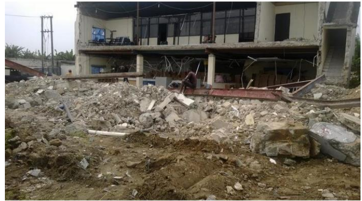
Figure 3: Concrete Demolition Waste along Trans-Amadi, Port Harcourt, Nigeria

building blocks and concrete. If disposed of, they form a large part of construction wastes are generated from these materials through demolition and cutting of the large-sized materials while being shaped [29] (see figure 3)